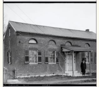
Jacob Habermehl House Columbia, IL

Monroe County, Illinois, has a rich history dating back to its early Native American inhabitants, including the Cahokia and Kaskaskia tribes. European settlement began in the 18th century with French explorers, and the area later came under British and then American control after the Revolutionary War.