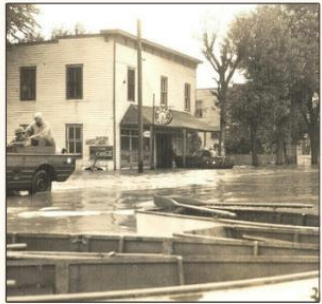
Flood of 1943 Valmeyer, IL

Founded on January 6, 1816, Monroe County was named after future U.S. President James Monroe. The towns of Waterloo and Columbia were largely settled by German immigrants, whose influence remains strong today. During the Civil War, Monroe County supported the Union.