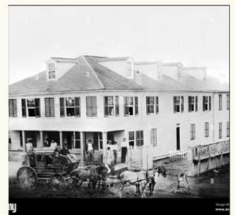
Buck Tavern Columbia, IL

Agriculture, particularly wheat, corn, and dairy farming, shaped the county's economy throughout the 19th and 20th centuries.