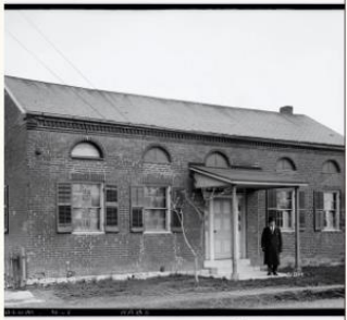
City Hall Hecker, IL

Monroe County, Illinois, has a rich history dating back to its early Native American inhabitants, including the Cahokia and Kaskaskia tribes. European settlement began in the 18th century with French explorers, and the area later came under British and then American control after the Revolutionary War.