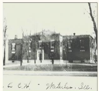
Monroe County, Court House Waterloo, IL