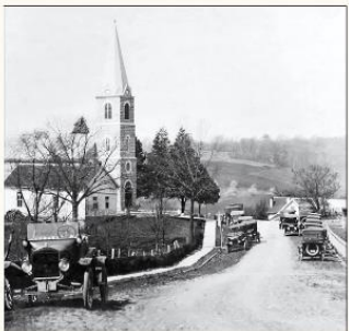
St. John's United Church of Christ Maeystown, IL

Today, Monroe County celebrates its heritage through historic sites like Bellefontaine House, Maeystown, and Peterstown House, preserving its French, German, and Native American roots.